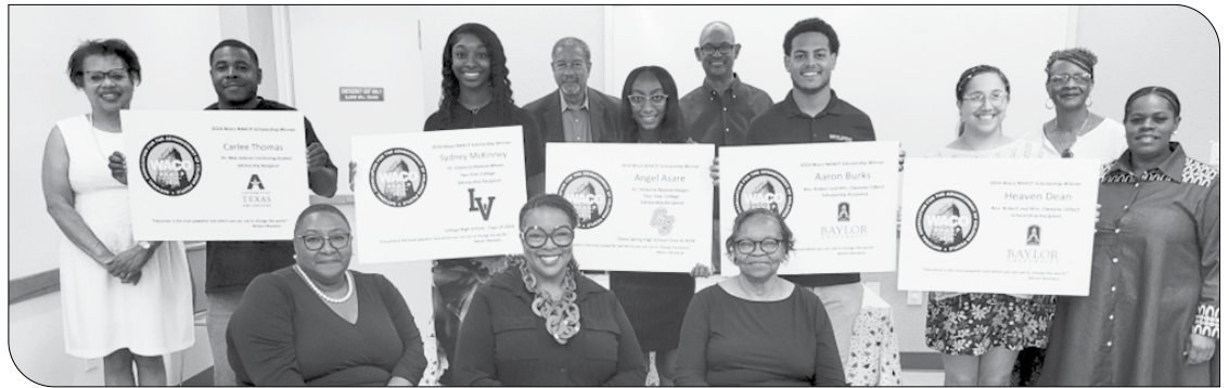
THE WACO NAACP NAMED ITS 2024 SCHOLARSHIP RECIPIENTS AT ITS MAY MEETING